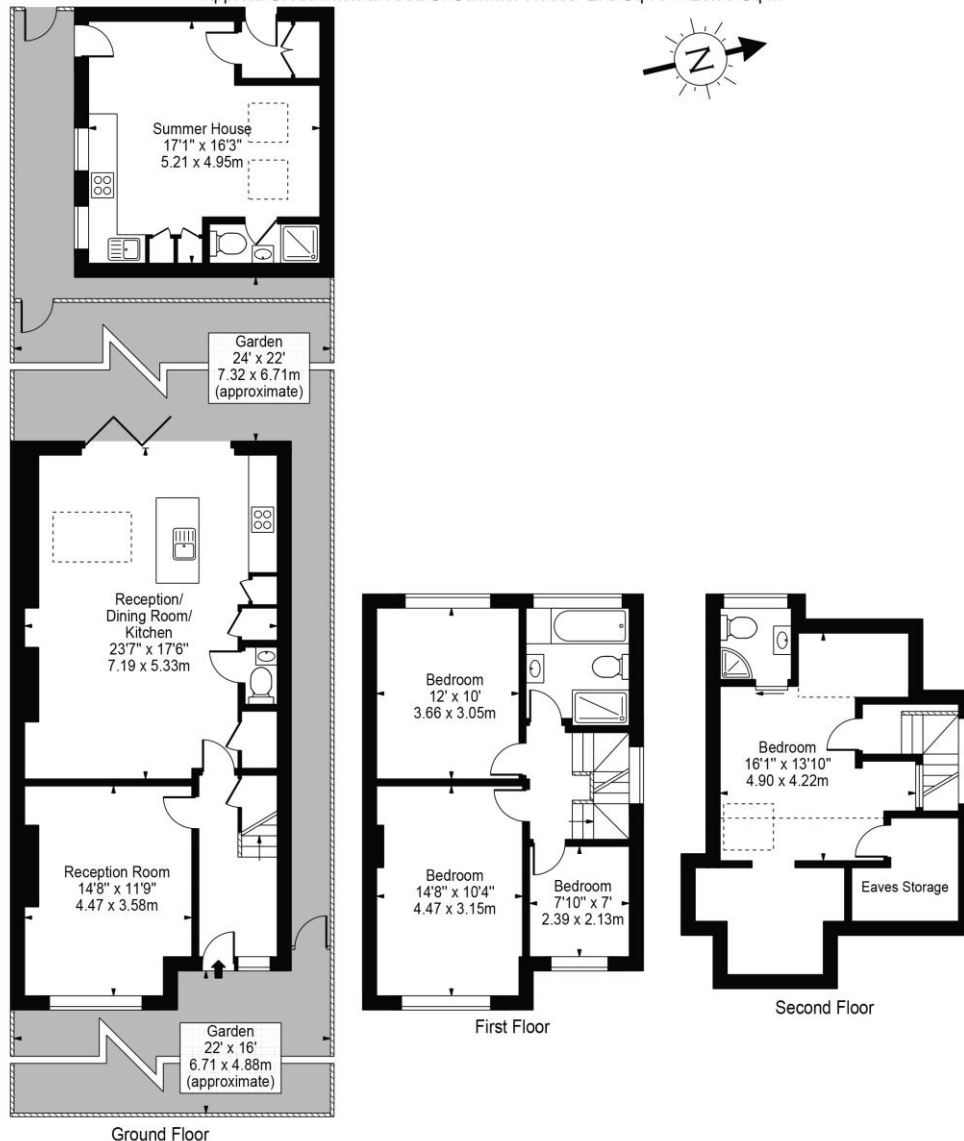
Ground Floor For Illustration Purposes Only - Not To Scale Floor Plan by Mira Nikolova Photography

Approx. Gross Internal Area Of Summer House 278 Sq Ft - 25.79 Sq M