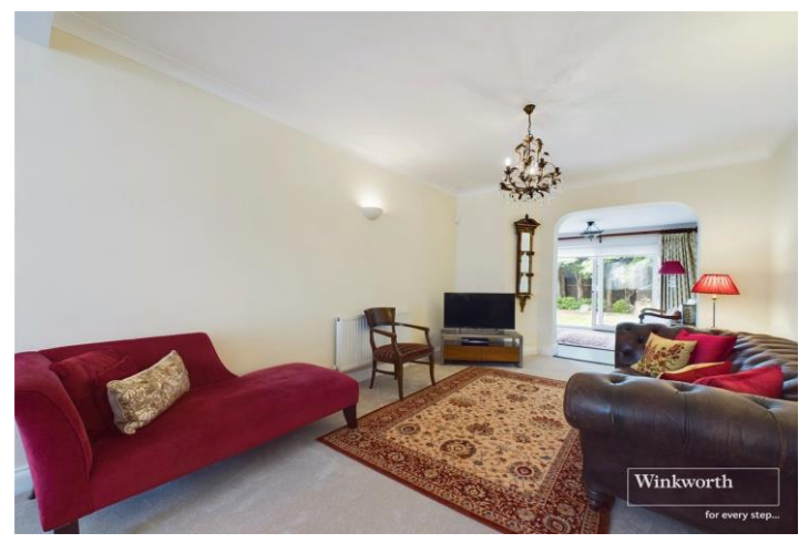
HALL LANE, HENDON, LONDON, NW4 £750,000 FREEHOLD