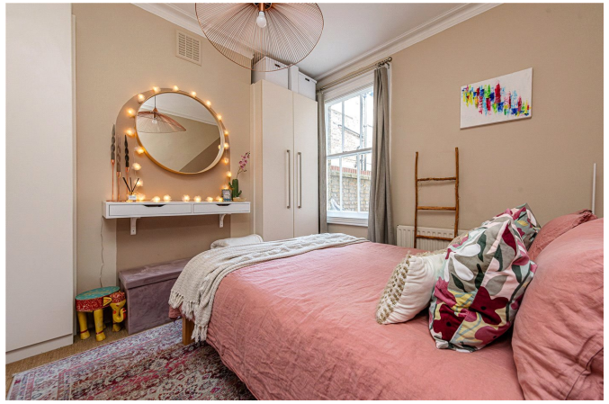
ILBERT STREET, QUEENS PARK, LONDON, W10 £500,000 FREEHOLD

A LOVELY AND CHARACTERFUL ONE DOUBLE BEDROOM GARDEN FLAT IN THE QUEEN PARK CONSERVATION AREA, PERFECTLY NESTLED BETWEEN LADBROKE GROVE AND QUEENS PARK.