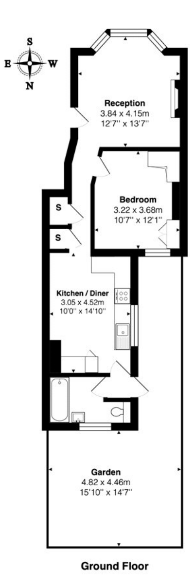
Total Area: 51.9 m<sup>2</sup> ... 559 ft<sup>2</sup> (excluding garden) All measurements are approximate and for display purposes only

This floorplan is for illustration purposes only and is not to scale. The position and size of doors, windows, appliances and other features are approximate.