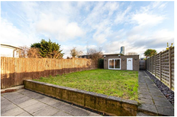
NORMAN WAY, LONDON, W3 £995,000 FREEHOLD