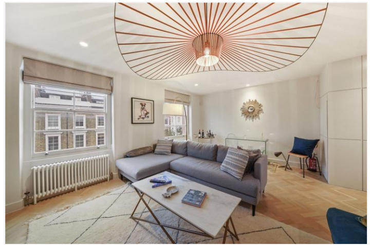
DURHAM TERRACE, W2 £1,450 PER WEEK (£6,283.33 PCM) Furnished

AN IMMACULATE AND BEAUTIFULLY PRESENTED AND FURNISHED TWO BEDROOM TWO BATHROOM MAISONETTE ON THE TOP FLOOR OF THIS IMPRESSIVE PERIOD BUILDING WITH FANTASTIC LIGHT THROUGHOUT.