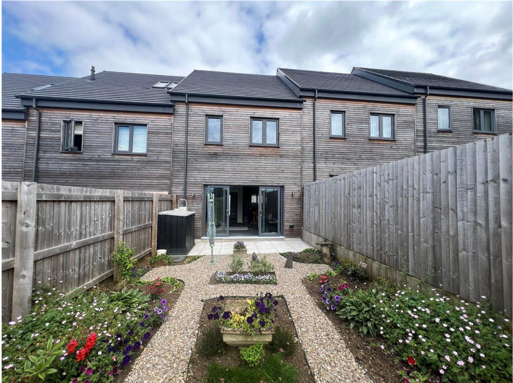
Stylish modern two-bedroom terraced house in Marlborough Guide Price £295,000