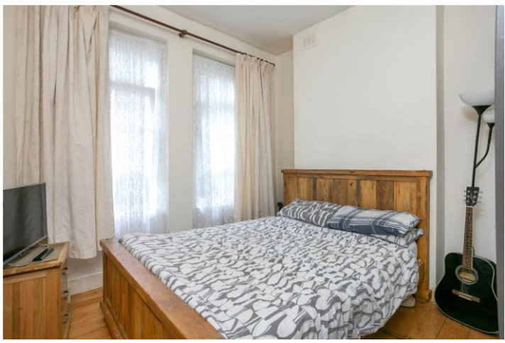
MORGAN MANSIONS, MORGAN ROAD, LONDON, N7 £525,000 LEASEHOLD