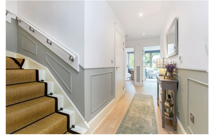
THURLOW PARK ROAD, SE21 £800,000 LEASEHOLD