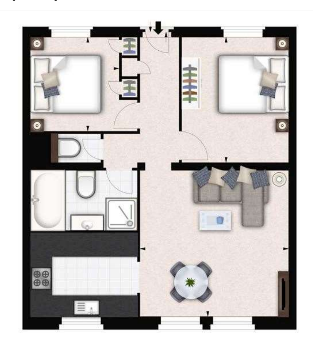
This floorplan is for illustration purposes only and is not to scale. The position and size of doors, windows, appliances and other features are approximate.

This newly decorated, interior designed superb two-bedroom apartment is set over 675 sq ft located in the heart of South Kensington. The apartment consists of a large bright reception room with which opens onto a modern open plan kitchen with fully integrated appliances and stone worktops, two double bedrooms, a modern fitted bathroom, and a guest cloakroom. The apartment is situated on the third floor of a private ported building benefiting from lift service.