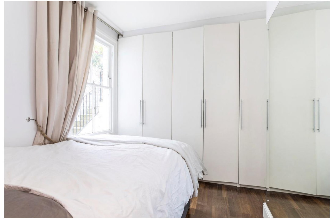
Large Private Garden | Own Entrance | new lease | Recently decorated