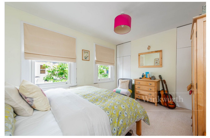
NAPIER ROAD, LONDON, NW10 £895,000 FREEHOLD

WINKWORTH ARE DELIGHTED TO BRING TO MARKET THIS THREE BEDROOM FAMILY HOME, FINISHED TO AN EXCELLENT STANDARD.