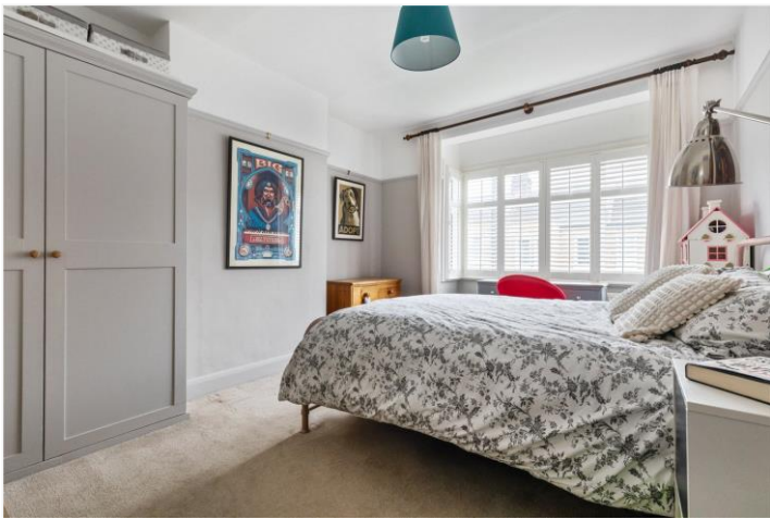
GATTON ROAD, LONDON, SW17 £975,000 FREEHOLD