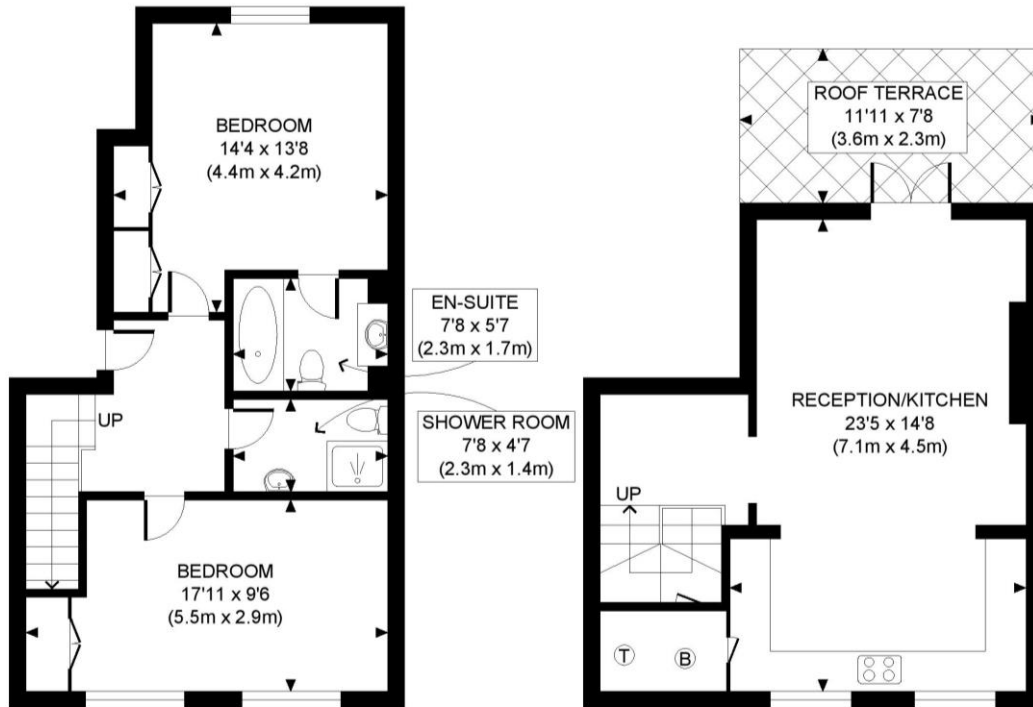
SECOND FLOOR GROSS INTERNAL FLOOR AREA 503 SQ FT