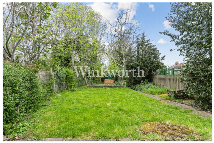
NEW RIVER CRESCENT, N13 OFFERS OVER £365,000 LEASEHOLD

A SPACIOUS TWO-BEDROOM MAISONETTE LOCATED CLOSE TO HAZELWOOD PRIMARY SCHOOL AND EASY REACH OF PUBLIC TRANSPORT LINKS AND PARKS.