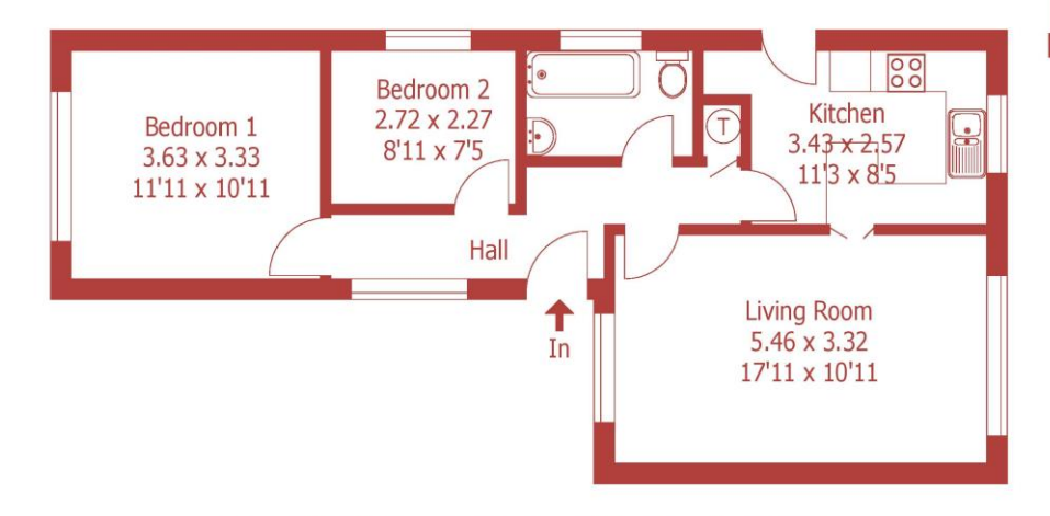
For identification purposes only, not to scale, do not scale

Approximate Gross Internal Area :- 60 sq m / 642 sq ft Garage Approximate Gross Internal Area :- 17 sq m / 182 sq ft