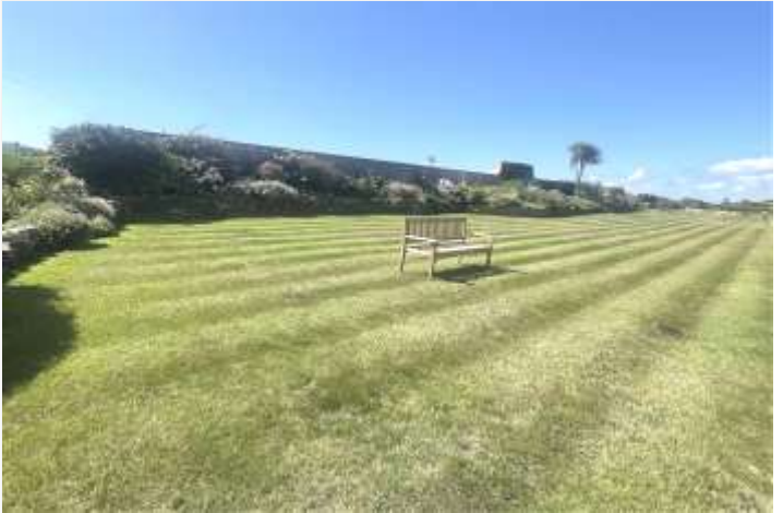
CAMDEN HURST, £370,000 SHARE OF FREEHOLD, COUCNIL TAX BAND-D, EPC-C

INTRODUCING A REMARKABLE GROUND FLOOR, THREE-BEDROOM APARTMENT SITUATED WITHIN WALKING DISTANCE TO THE SEAFRONT. FEATURING A PRINCIPAL BEDROOM WITH EN-SUITE, A SPACIOUS FAMILY BATHROOM, A GENEROUSLY SIZED SITTING ROOM AND DINING AREA THAT OPENS ONTO A PRIVATE OUTDOOR SOCIAL PATIO AREA. RESIDENTS BENEFIT FROM EXCEPTIONAL COMMUNAL AMENITIES, INCLUDING A HEATED SWIMMING POOL, TENNIS COURT AND BOWLING GREEN.