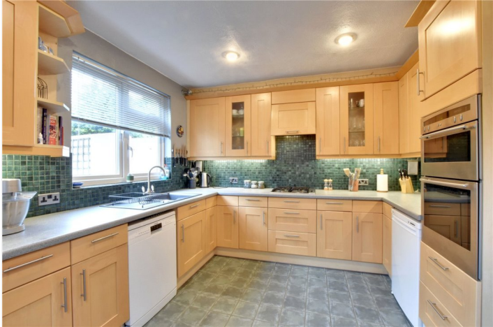
HEATHWOOD GARDENS, CHARLTON, LONDON, SE7 £825,000 FREEHOLD

WE ARE DELIGHTED TO OFFER THIS PRETTY, FOUR BEDROOM, THREE STOREY, FAMILY HOME THAT MEASURES AN IMPRESSIVE 1929 SQ FT AND IS LOCATED ON THIS QUIET AND IMMENSELY POPULAR ROAD, LOCATED JUST EAST OF CHARLTON VILLAGE!