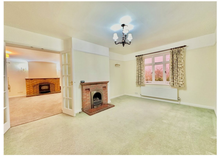
Bridle Path, Farnham, GU10