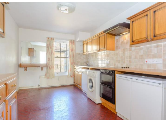
3 Gerrard Buildings, Bath, Somerset, BA2 4DQ