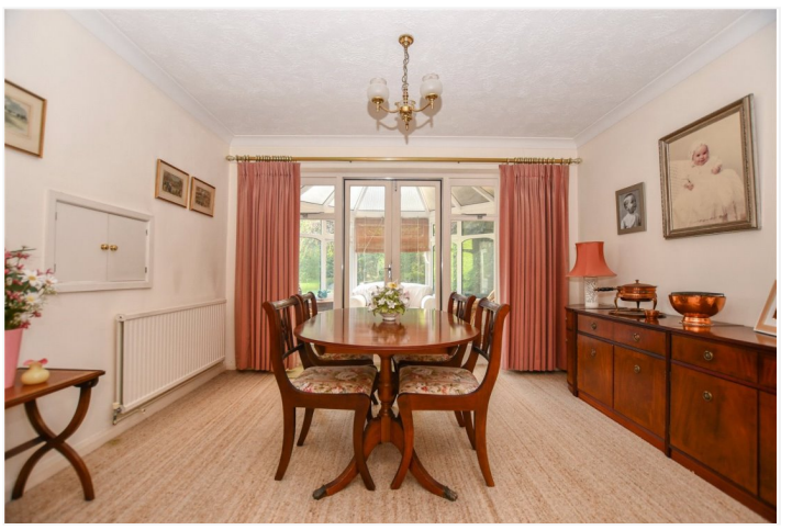
23 FOXGLOVE CLOSE, WOKINGHAM, BERKSHIRE, RG41 3NF £735,000 FREEHOLD

SITUATED IN ONE OF WOKINGHAM'S MOST SOUGHT AFTER DEVELOPMENTS IS THIS 4 BEDROOM DETACHED FAMILY HOME OFFERED TO THE MARKET WITH NO ONWARD CHAIN.