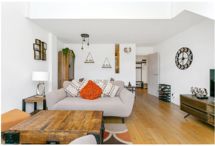
97-113, CURTAIN ROAD, LONDON, EC2A £780,000 LEASEHOLD