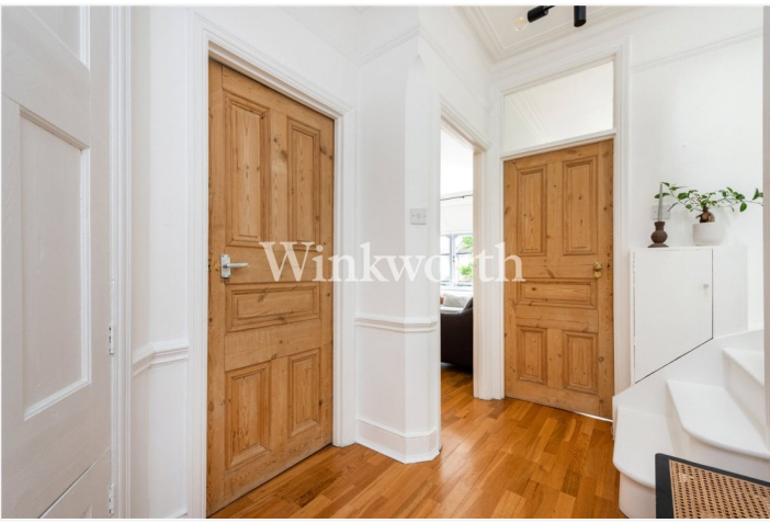
CAVERSHAM AVENUE, N13 OFFERS OVER £500,000 SHARE OF FREEHOLD

A LIGHT AND SPACIOUS THREE-BEDROOM SPLIT-LEVEL FLAT IN A DESIRABLE LOCATION CLOSE TO PALMERS GREEN RAIL STATION.