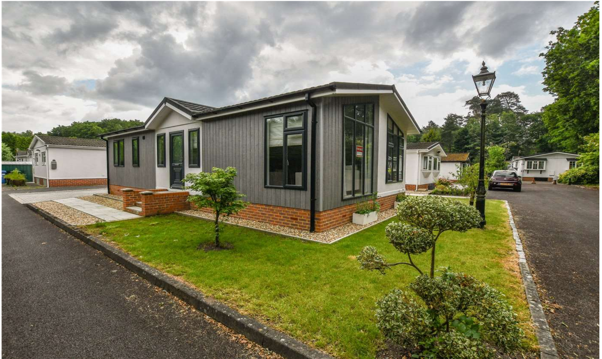
1 PINWOOD CARAVAN PARK, WOKINGHAM, BERKSHIRE, RG40 3EF £230,000 LEASEHOLD