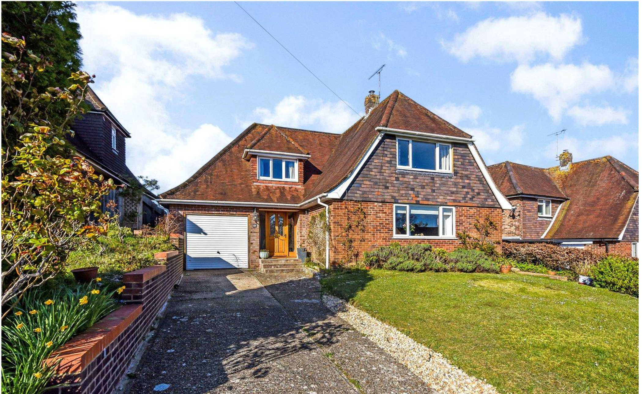
Teg Down Meads, Winchester, Hampshire, SO22 5NN