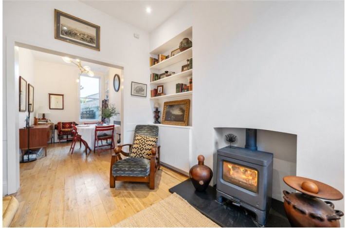
KENT HOUSE ROAD, LONDON, SE26 £850,000 FREEHOLD

This is a rare opportunity to own a distinguished Georgian home in Sydenham, meticulously curated to combine period charm with modern elegance. Winkworth