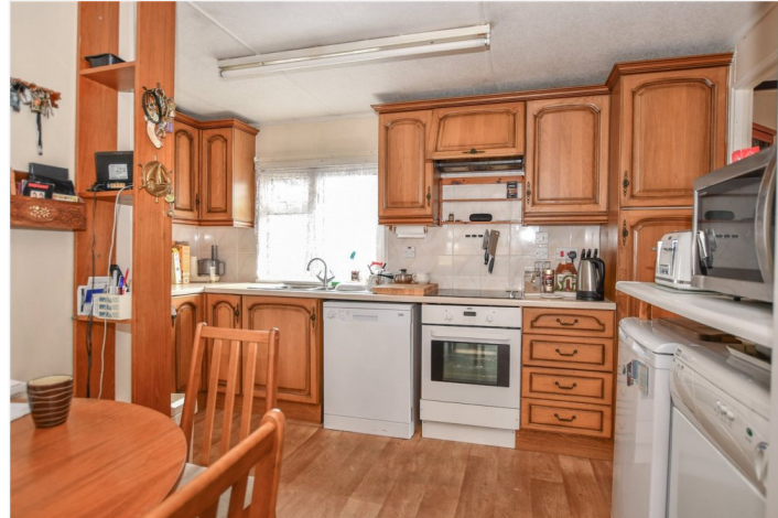
12 GROVELANDS PARK, WINNERSH, WOKINGHAM, BERKSHIRE, RG41 5LD £170,000

THIS EXTENDED THREE BEDROOM PARK HOME SITS ON A WONDERFUL DOUBLE PLOT AND IS CONVENIENTLY SITUATED ON THE FAMILY AND PET FRIENDLY GROVELANDS PARK IN WINNERSH WITHIN CLOSE PROXIMITY TO AMENITIES.