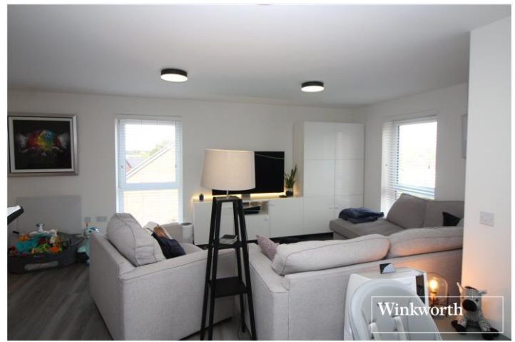
ARK AVENUE, HERTFORDSHIRE, WD6 £400,000 LEASEHOLD