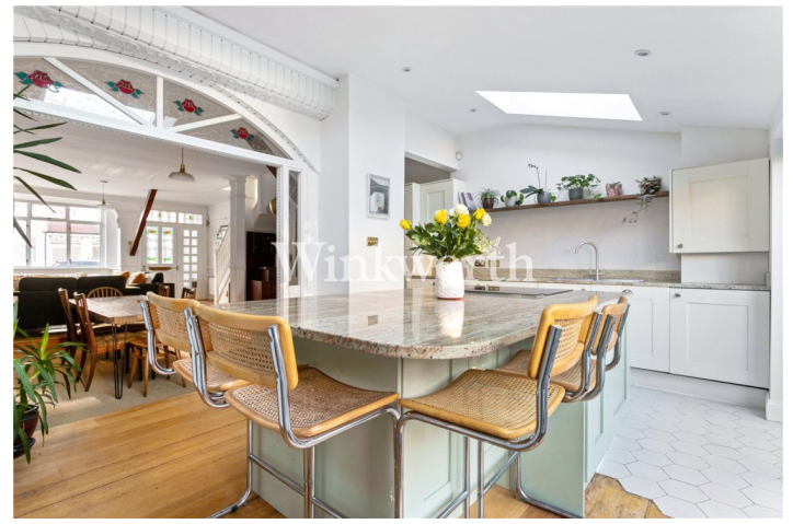
SHERRINGHAM AVENUE, N17 £715,000 FREEHOLD