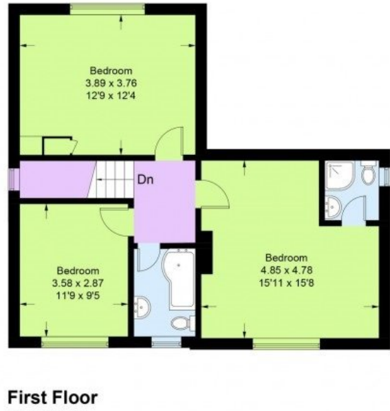
First Floor 684 Sq ft

Illustration for identification purposes only, measurements are approximate, not to scale. (ID966338)