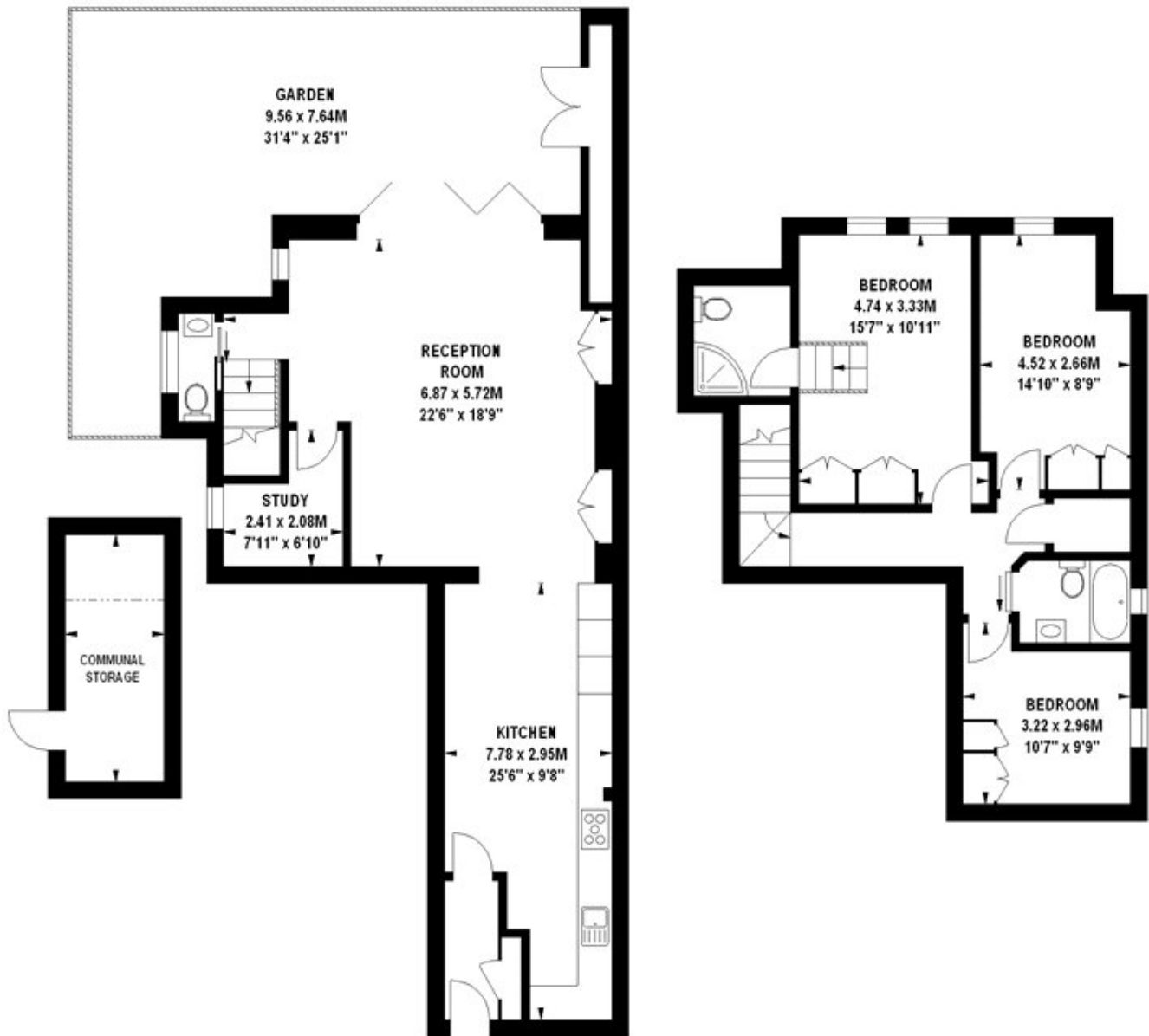
705 sq ft Lower Ground Floor