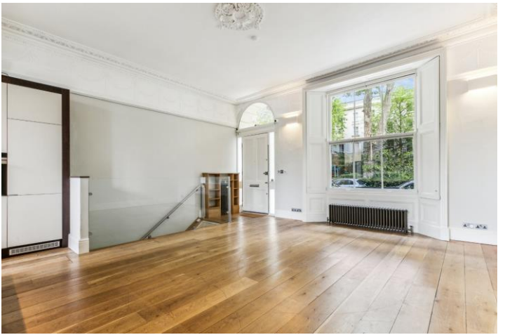
PORCHESTER SQUARE, BAYSWATER, W2 £1,600,000 LEASEHOLD

LOCATED IN W2 - BAYSWATER CONSERVATION AREA, A WELL-PROPORTIONED, THREE BEDROOM DUPLEX MAISONETTE APARTMENT, WITH HIGH CEILINGS, ORNATE CORNICING AND PORTICOED STEPS LEADING TO ITS OWN FRONT DOOR. SET WITHIN A HANDSOME VICTORIAN STUCCO FRONTED BUILDING AND OPPOSITE ONE OF THE MOST BEAUTIFUL GARDEN SQUARES IN BAYSWATER.