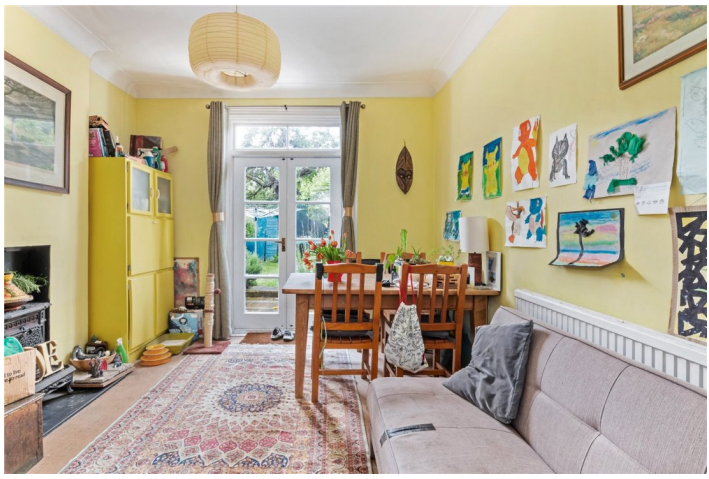
RAVENSBOURNE ROAD, LONDON, SE6 £875,000 FREEHOLD