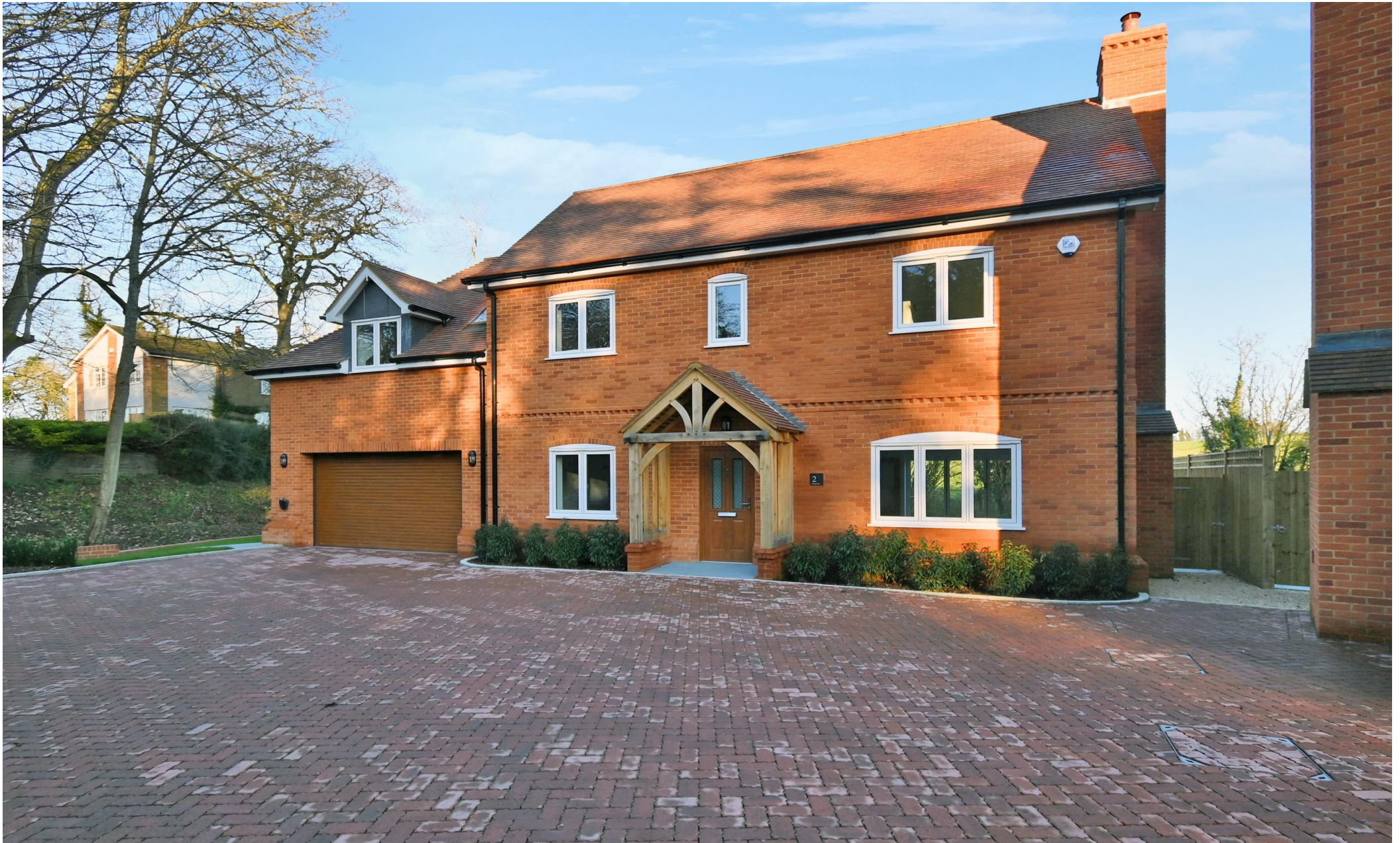
Plot 2 Waterside Frog Lane Mapledurwell Hampshire RG25 2LP