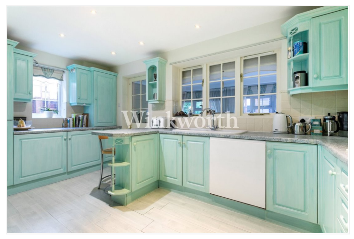
CROTHALL CLOSE, N13 OFFERS OVER £875,000 FREEHOLD