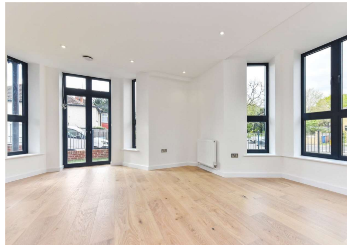
Forest Hill Road, SE23