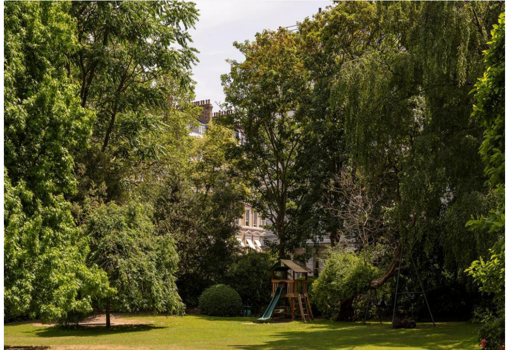
Share of Freehold | Two Double Bedrooms | Communal Gardens (Subject to Application) | Prime Location