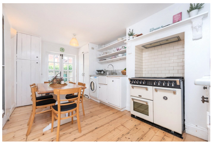
RUCKLIDGE AVENUE, LONDON, NW10 £660,000 FREEHOLD

A THREE DOUBLE BEDROOM FREEHOLD HOUSE, WITH OFF STREET PARKING, NO UPPER CHAIN AND POTENTIAL TO EXTEND (STPP). LOCATED MOMENTS FROM ROUNDWOOD PARK AND WILLESDEN JUNCTION STATION.