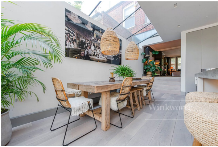
SPEZIA ROAD, LONDON, NW10 £1,650,000 FREEHOLD

A STUNNING FIVE-BEDROOM FAMILY HOME SITUATED ON A LOVELY QUIET STREET IN THIS POPULAR LOCATION TO THE WEST OF KENSAL GREEN, ONE OF THE BEST PROPERTIES WE HAVE SEEN IN A LONG TIME.