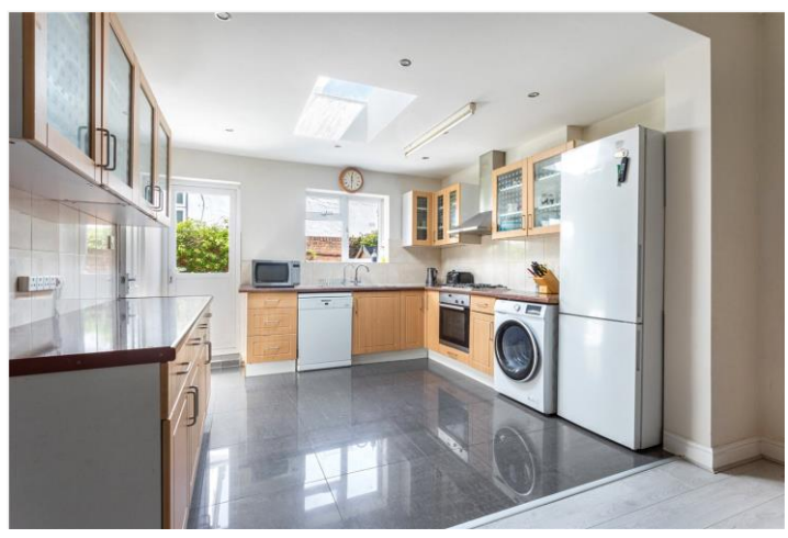
BROADWATER ROAD, SW17 £875,000 FREEHOLD