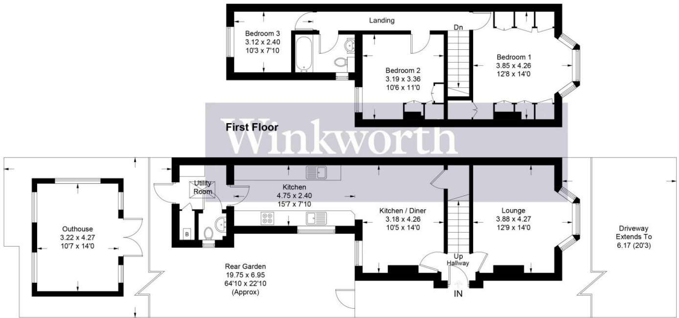
Illustration for identification purposes only, measurements are approximate, not to scale. Winkworth © 2024 (ID1064918)

Approximate Gross Internal Area = 97.7 sq m / 1052 sq ft Outhouse = 13.6 sq m / 146 sq ft Total = 111.3 sq m / 1198 sq ft