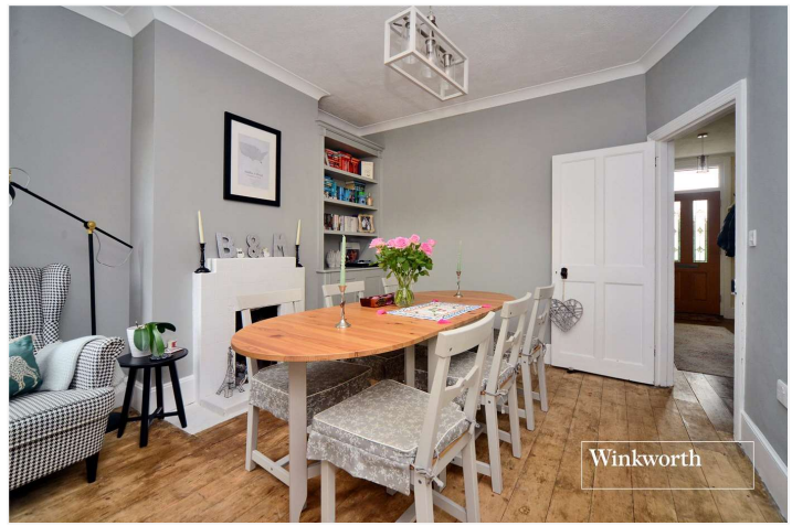
GANDER GREEN LANE, SUTTON, SM1 £500,000 FREEHOLD

A BEAUTIFULLY PRESENTED PERIOD PROPERTY, LOCATED WITHIN EASY REACH OF CHEAM VILLAGE AND SUTTON TOWN CENTRE