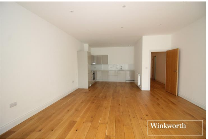
GOLDRING WAY, ST. ALBANS, HERTFORDSHIRE, AL2 £499,950 LEASEHOLD