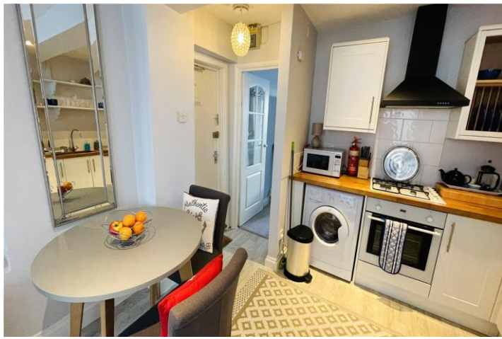
VICTORIA ROAD, DARTMOUTH £199,950 LEASEHOLD