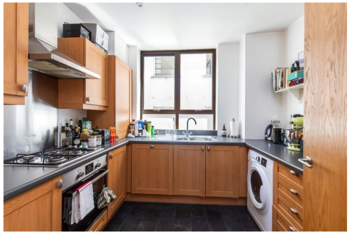
ISLINGTON GREEN, LONDON, N1 £575,000 LEASEHOLD