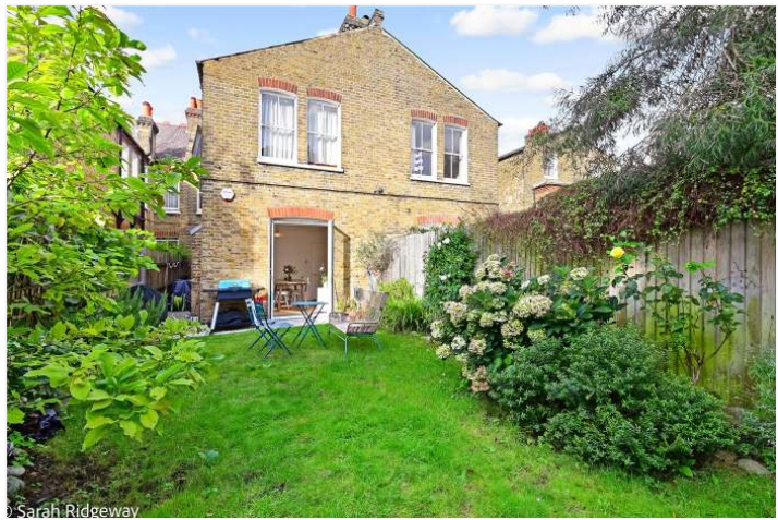
TYRRELL ROAD, EAST DULWICH, SE22 £650,000 SHARE OF FREEHOLD