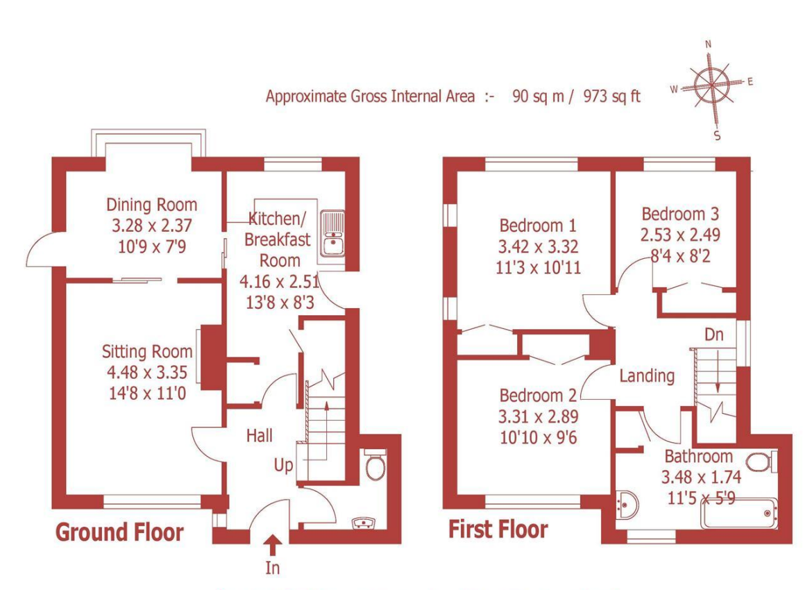
For identification purposes only, not to scale, do not scale Drawn using existing drawings and dimensions