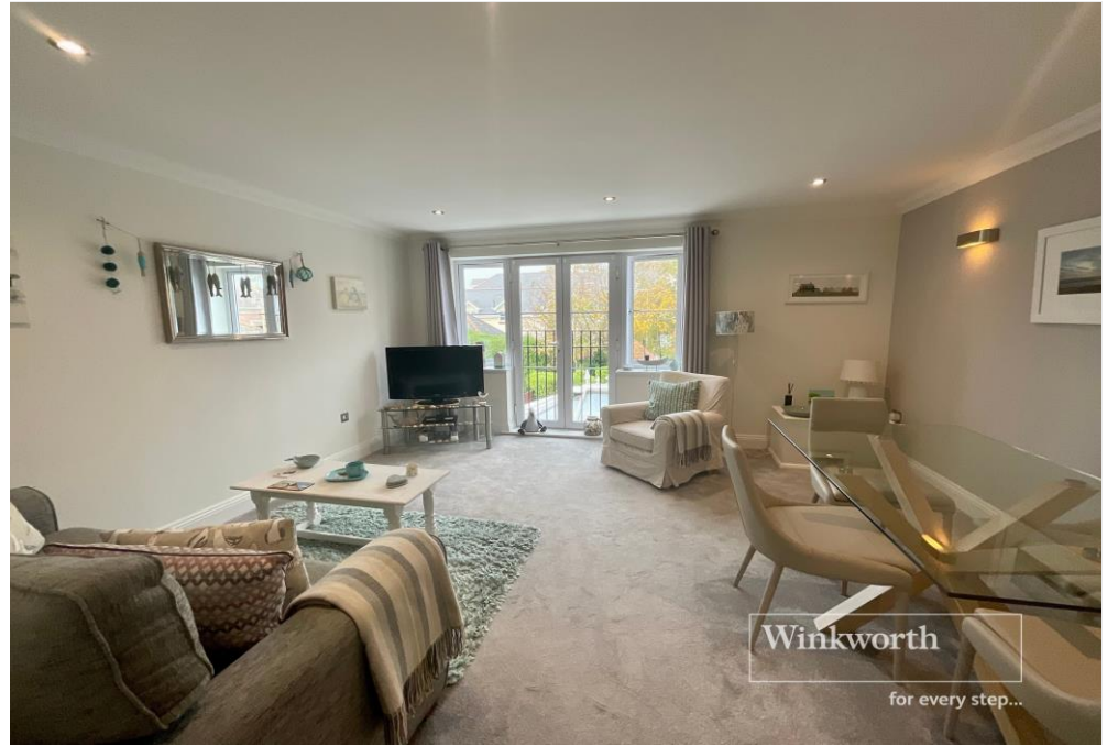
Winkworth for every step...