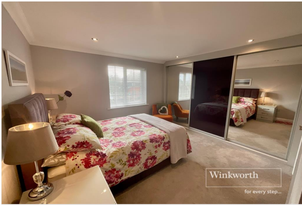
Winkworth for every step...