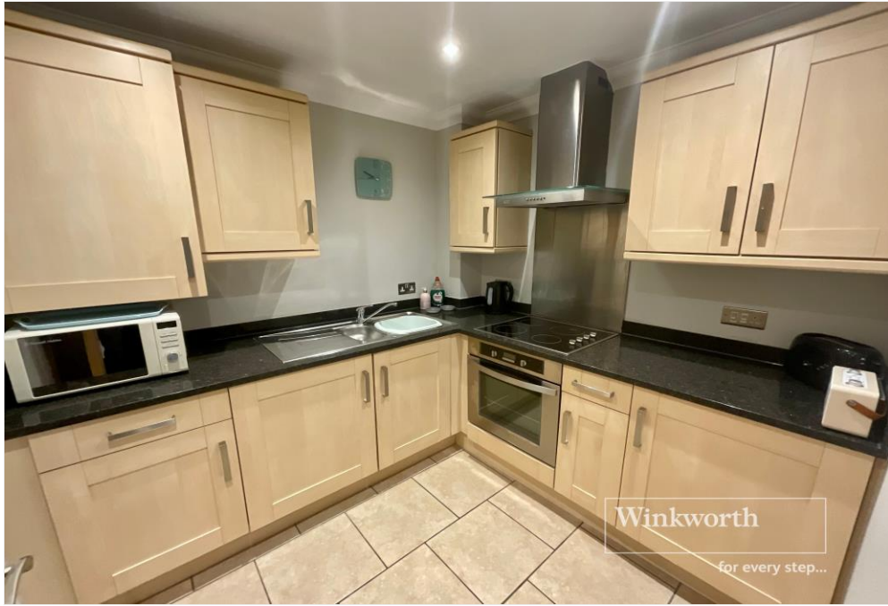
Winkworth for every step...