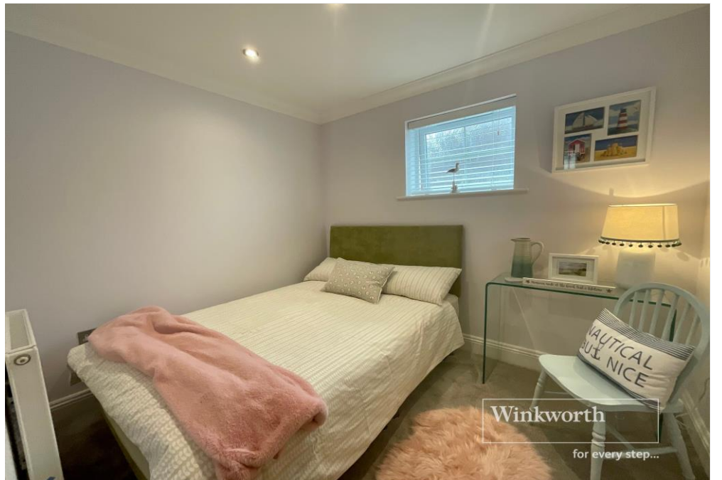
Winkworth for every step...