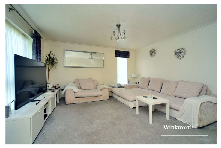
WORCESTER ROAD, SUTTON, SM2 £340,000 LEASEHOLD