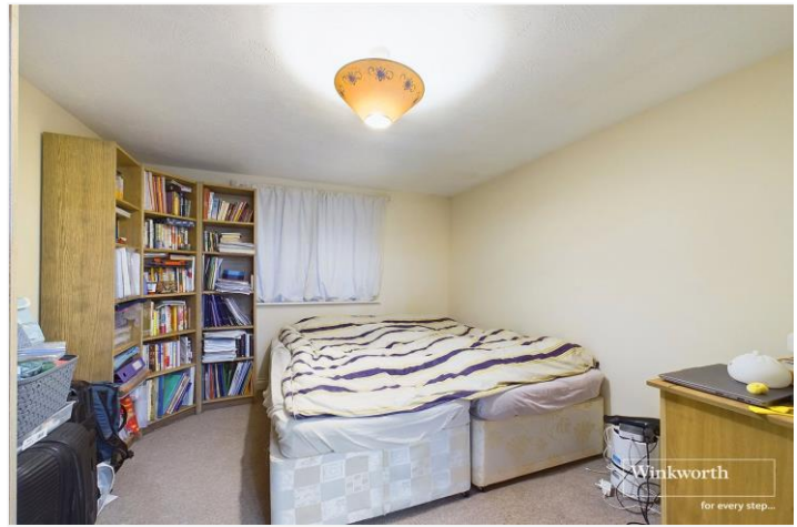
KINGS OAK COURT, READING, BERKSHIRE, RG1 4PX GUIDE PRICE £275,000 LEASEHOLD