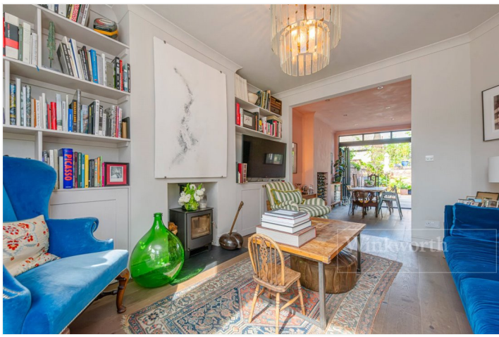
TRENMAR GARDENS, NW10 £975,000 FREEHOLD